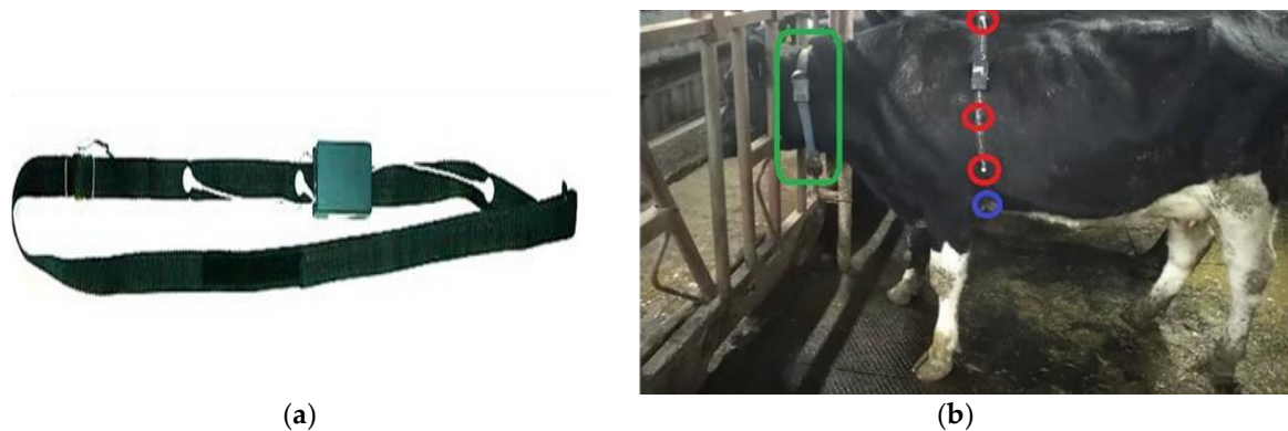
Figure 2. Placing the experimental sensor: sensor electrodes (a) were placed on the cow at the gogo, on the left side of the abdominal wall (b).

After cleaning, the sensor was placed. The sensor electrodes (Figure 2a) were positioned on the left side of the body. The negative electrode was placed on the left side of the animal behind the caudal portion of the blade, the positive electrode was placed on the left side of the body at the armpit or sternum, and the ground electrode was placed on the left side of the body just below the chest area (Figure 2b). The ground electrode can be placed anywhere on the body, but the gogo area was selected for optimal belt configuration. All of these electrodes were mounted on a belt and formed a line.