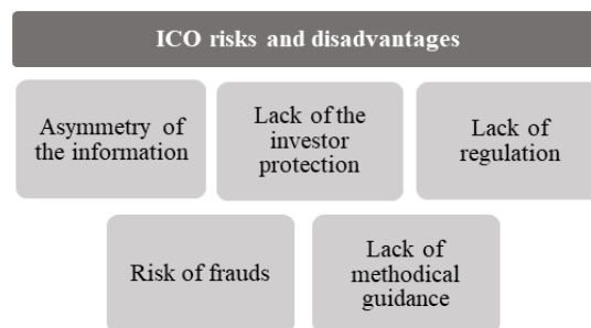
Fig. 2. The most often analysed risks and disadvantages of ICO in the scientific literature.

In literature ICO is often mentioned as new, volatile, high-interest, but still poorly researched innovative financing method. As Amsden and Schweizer (2018) claim, ICO, as a method of raising capital for blockchain based companies, is a new phenomenon and little is known about the decision-making process of ICO investors. They are also supported by De Jong et al. (2018) pointing out that despite the growing popularity of the ICO, the number of successful ICOs began to decline, and regulators drew attention to the risks of largely unregulated ICOs, that are often mentioned in the literature (see Figure 2).