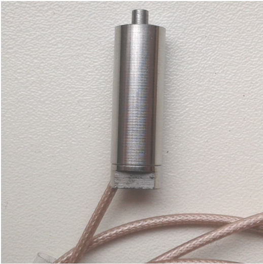
Figure 1. The stack type piezoactuator made by PiezoMechanik.

28mm length ( L=28\text{mm} ) stack type low voltage piezoactuator of model PSt 150/4/20 VS9 (Fig. 1), made by PiezoMechanik company, was selected as a source for generation of high frequency vibrations. This actuator generates longitudinal high frequency vibrations.