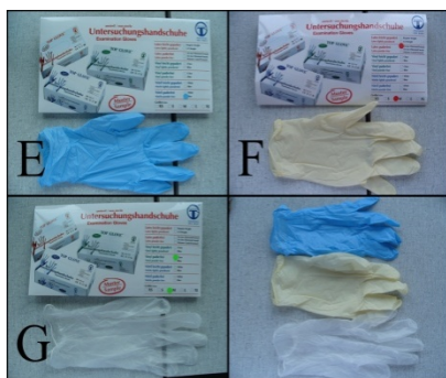
Fig. 2. E - Nitrile pf gloves; F - Latex p, pf gloves; G - Vinyl p, pf gloves;