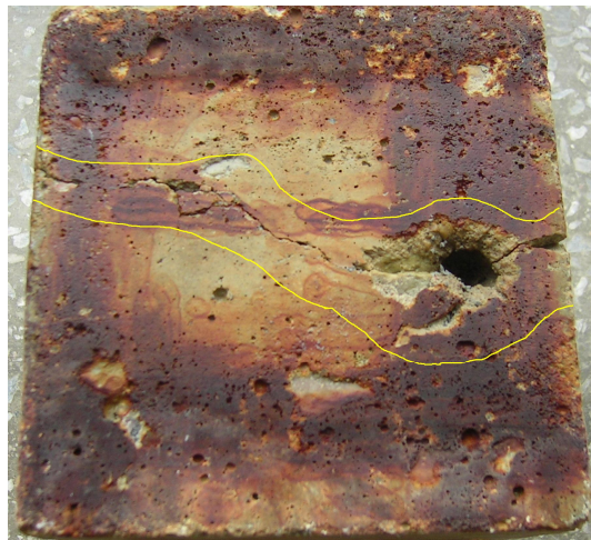
Concrete samples after 550 freezing and thawing cycles (B4 concrete composition)