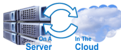
Figure 1. Web based accounting systems location

So, today the web based accounting software is internet-based technology where the information is stored on the server or in the cloud (Figure 1). The cloud based accounting system is basically a way to run business accounts entirely online and provided as a service (Software as a Service) on-demand to clients (from the "clouds" indeed) It is also known as online accounting, or in some circumstances SaaS (software as a service) accounting software. Its impact will be on both consumers and firms. On one side, consumers will be able to access all of their accounting data from any device like the personal laptop or the mobile phone (Nesbit, 2009; Walsh, 2011). On the other side, firms will be able to rent the software from a service provider and to pay on demand.