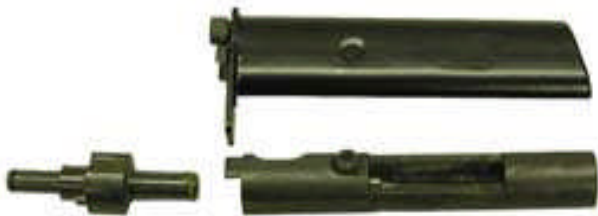
Fig. 2. CO 2 gas recoil system for M16

3. Electronically control level manages proper and concerted work of system's electronics and realizes the input/output functions. These functions execution with maximal high speed performance are mandatory necessary to increase the data exchange inside the system. Usually the program code is not complicated, but it needs the synchronization with other control unit [4].