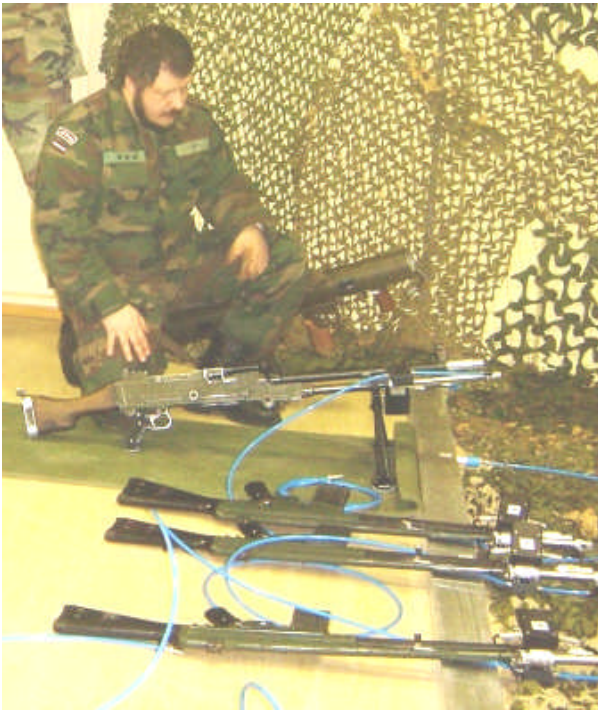
Fig. 5. Shooting simulator SAIKU-8

Ministry of Defense of Latvia was ordered shooting simulator for recruits and soldiers group training and marksmanship skills in 2004. The shooting simulator SAIKU-8 [9] had been presented after 9 months. The basic model supports 8 shooting places.