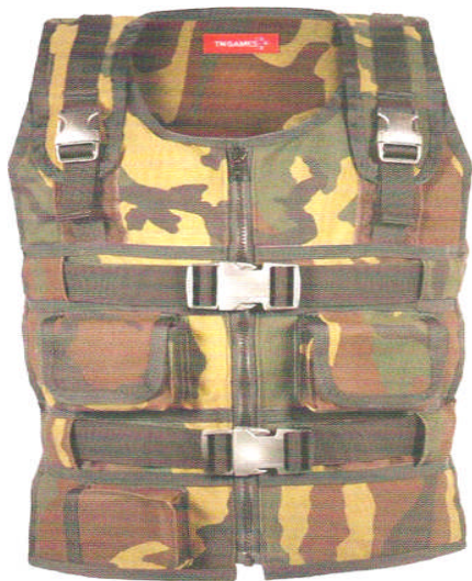
Fig. 4. Patented Impact Generating Technology 3rd Space Vest

The lasers simulating the shot are used on the weapons to simulate ballistic characteristics of live-fire weapons. Multiple Integrated laser Engagement System (MILES) [8] is the most frequently used laser training system, which is dealing with laser diode technology. The MILES training system provides a realistic battlefield environment for soldiers involved in training exercises. MILES provides tactical engagement simulation for direct fire force-on-force training using eye safe laser "bullets". Each individual and vehicle in the training exercise has a detection system to sense hits and perform casualty assessment. Laser transmitters are attached to each individual and vehicle weapon system and accurately replicate actual ranges and lethality of the specified weapon systems.