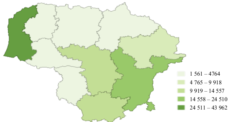
Figure 3. Number of places in accommodation, 2023