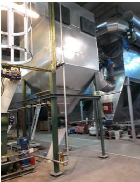
Fig. 2. Biomass heat plant in Valladolid.

Spanish National Integrated Plan for Economy and Climate (PNIEC) for 2030, which requires a minimum renewable energy penetration level of 42%.