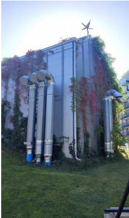
Fig. 1. Laboratory of Architecture.