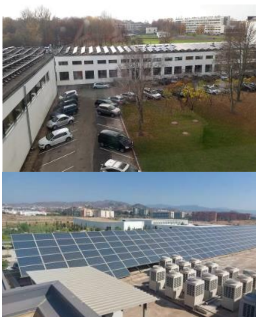
Fig. 4. PV panels in Kaunas.

The University of Malaga, specifically at the School of Industrial Engineering and the Smart Malaga project, are excellent examples of how universities can integrate renewable energy technologies and intelligent systems to enhance energy efficiency and contribute to a more sustainable environment. The School of Industrial Engineering features a renewable energy production through photovoltaic solar power. It consists of a 1 MW photovoltaic installation (Fig. 4), effectively generating electricity from renewable sources, thus reducing dependence on non-renewable energy sources. Furthermore, the implementation of energy management systems that control heating, ventilation, and lighting is crucial to optimize energy usage and reduce waste. This involves tailoring energy consumption to specific needs, thereby enhancing efficiency. Also noteworthy is the integration of innovations for Smart Buildings. Being part of the Smart Malaga project showcases the university's commitment to innovation and the adoption of advanced technologies to decrease energy consumption and improve air quality in university buildings.