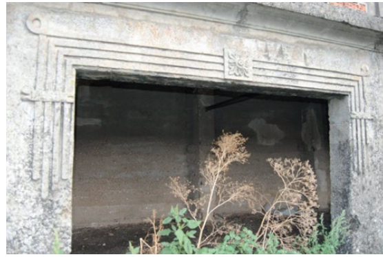
Fig. 3. Details created by the moulding around the windows of the hangar

According to the inventory of the building, the skeleton of the building is relatively deteriorated (Fig. 4). However, it is structurally in good condition. 25 When the various historic photographs of the structure and the building are analysed at the site, it can be noted that the entrance of the central axis was only from the front. Therefore, the rear