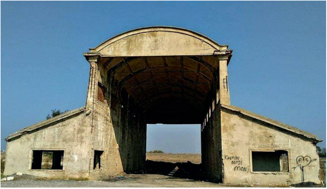
Fig. 4. Front façade of the hangar. Photo by Huriye Armağan Doğan, 2021