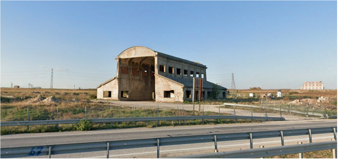
Fig. 1: The general view of the hangar from the highway.

Hindenburg disaster, affected the usage of these airships for commercial purposes. 22 Although, it can also be stated that the increasing pace of technology, with aeroplanes becoming a faster and more reliable means of transportation, might have also ended the heyday of the zeppelins.