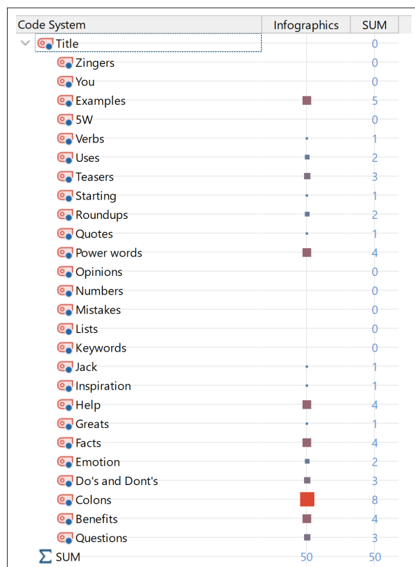
Figure 3. Most common tactics for formulating titles in sports infographics

The results of the study revealed that the practice of creating both titles and subtitles of sports infographics is partially similar to the universal recommendations for the creation of this type of written communication. Ten out of 26 headline writing tactics suggested for online content (see Feldman, 2019) were also used in the studied set of titles and subtitles of sports infographics. The