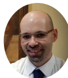
Associate Editor-in-Chief of Materials . Norwegian University of Science and Technology, Norway