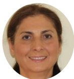
Editor-in-Chief of Materials . McGill University, Canada