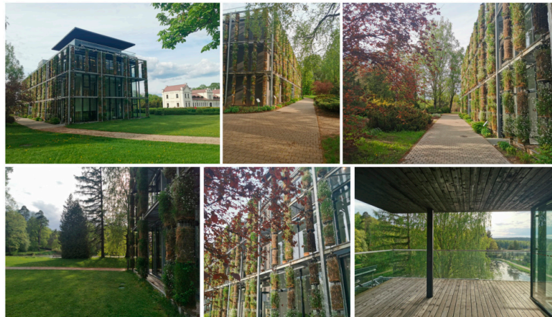
Figure 3. Vilnius University Kairenai Botanical Garden’s Green Building-Plant with external layer of vegetation was selected as an example of applied biophilic design.