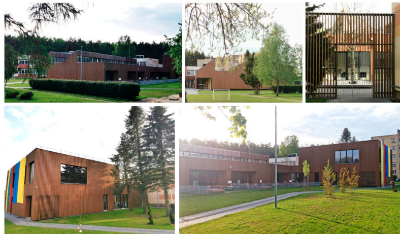
Figure 2. Kindergarten “Peledziukas” located in Vilnius, made with materials and roof configuration recalling traditional wood architecture was selected as an example of mimetic biophilic design.