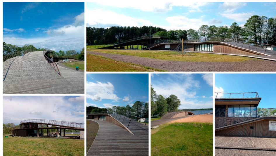
Figure 4. Recreation and Water Center in Zarasai with landscape-inspired volumes and nature-like spatial characteristics was selected as an example of organic biophilic design.