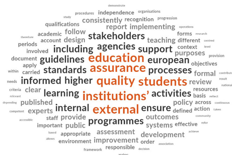
Figure 2. Word cloud of ESG guidelines

Figure 2 shows that the ESG guidelines do not include the terms “sustainable development” or “sustainability”; but other words frequently linked to them such as “stakeholders,” “environment” and “responsible” appear in the cloud. However, without context, these words risk being misinterpreted. A link between the most frequently used words and transformative learning is harder to find.