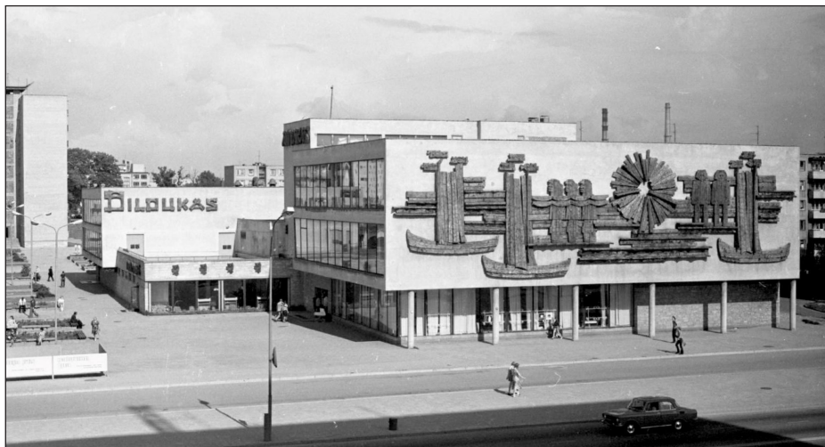
Figure 6: Aitvaras shopping centre and Bildukas restaurant in Klaipėda, 1977.

Actually, no city-wide shopping centres were found in the LSSR; however, such shopping centres as Žirmūnai, Stumbras, Girstupis, Kalniečiai, Šeškinė or Aitvaras having represented the key idea of Soviet shopping centres, that is to provide commercial and household services to settlers of mikrorajons and residential areas, used to extend their scope by their functions, thereby becoming city-wide attractions to the population, as due to the scarce supply of products shoppers were looking for goods in different commercial locations. In each residential area or mikrorajon, at least one shopping centre of a similar composition and functionality was situated. Although the plans for residential areas included more shopping centres with a great range of functions, analysis of the aforementioned sources has demonstrated that the construction of shopping centres was not so rapid as it was supposed to be, and therefore, smaller shops of a different nature were constructed in order to compensate for deficiencies.