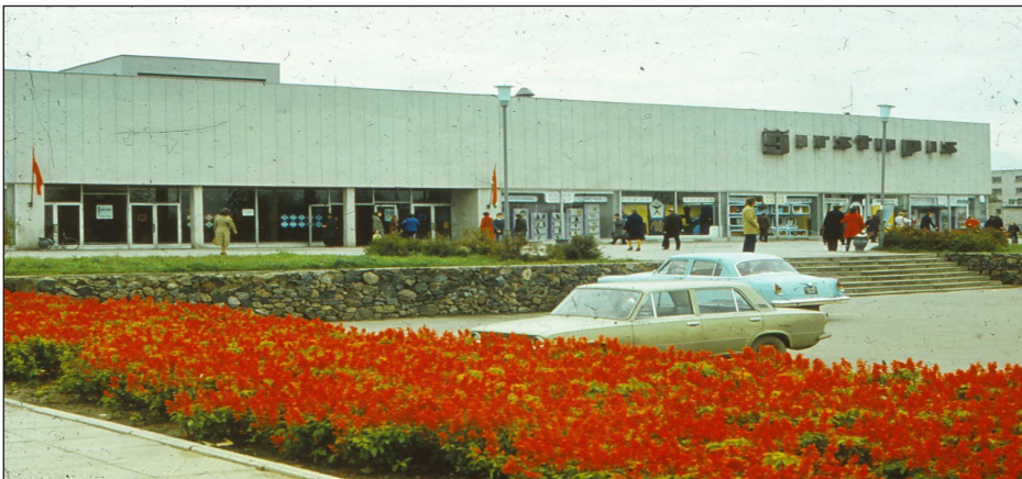
Figure 8: Facade and window displays of the shopping centre Girstupis in Kaunas, 1978.

Concerning the absence of advertising on the exterior of shopping centres, attempts were made to explain this situation by the rational advertising used in the interior of the shopping centres that was applied on the grounds of the responsive service of buyers and easing the complexity of the services provided. For instance, the advertising publication of the shopping centre "Vitebskas" located in the Kalniečių Residential Area in Kaunas declared that the "precious time of a buyer is saved by accurate and