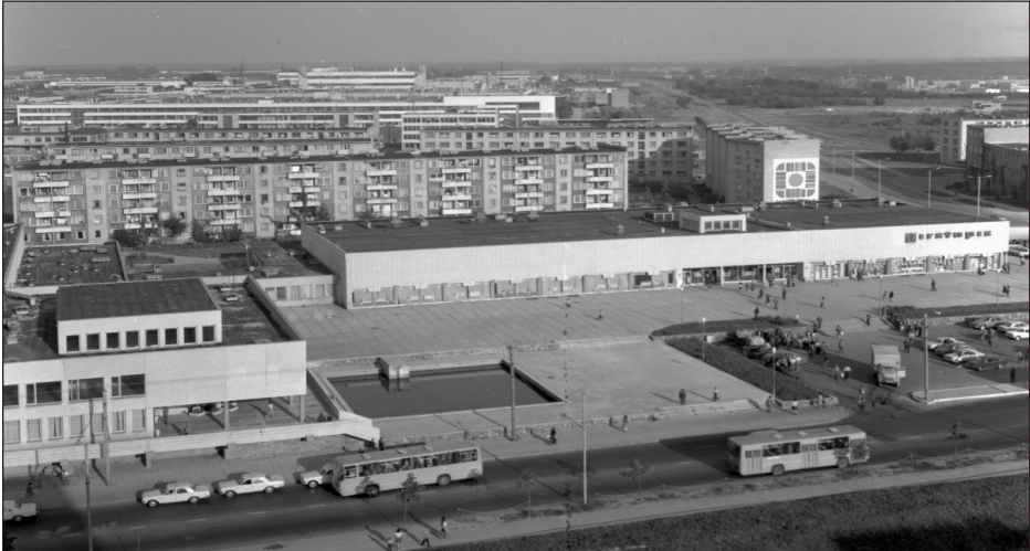
Figure 3: Girstupis shopping centre in Kaunas, 1978.

monumentality of the cultural hub, the square paved with large slabs and shaped at the shopping centre and the clear layout of the shopping centre offering a good sense of direction for buyers. 54 (Fig. 3)