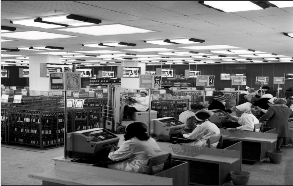
Figure 11: Interior of the shopping centre Debrecenas in Klaipėda, 1974.

The promotional leaflets of shopping centres were also used to enhance the architectural image of shopping complexes as efforts were made by Soviet propaganda to underline the construction achievements of Soviet commercial buildings. In light of the above, instead of introducing the goods available for sale, the promotional leaflets of a range of shopping centres emphasize the vast number of tons of steel and concrete used for the construction of shopping complexes along with the modern finishing materials and the visual design solutions for exteriors and interiors. For instance, "After opening the door of the shopping centre 'Papartis', you will be captivated by the original advertising and characteristic interior with ceramic tiles, laminated panels and organic glass used for its decoration". 76 In this way, printed information was employed to give a preconceived opinion to buyers about both the goods and the modern style of the very commercial building.