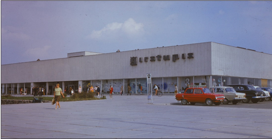
Figure 7: Facade and window displays of the shopping centre Girstupis in Kaunas, 1974.