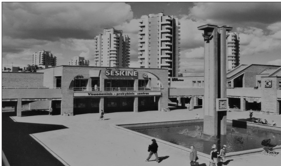
Figure 4: Šeškinė shopping centre in Vilnius, 1985.

Differently from other shopping centre designs, the complex of the shopping centre Šeškinė was evaluated critically due to its insufficient links between the eastern and western blocks as they were separated by the street. Another problem was the lack of visual relations and connections between the complex and the square nearby. 57 Some establishments designed in this shopping centre were never opened, while the realization of the very centre remained incomplete.