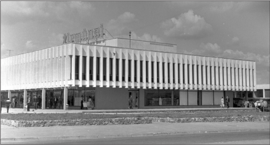
Figure 1: Žirmūnai shopping centre in Vilnius, 1969.

the fact that it was one of the first shopping centres of this kind, the new building was named as an experimental commercial/household centre. It contained a department store, post office, telephone station, savings bank, grocery store, vegetable store, restaurant, pharmacy, water syphon filling station, hairdressing salon/barbershop, chemical cleaning and dyeing shop, watch repair shop, laundry etc. 48 According to the architects of that time, the shopping centre under discussion enabled the analysis of advantages and disadvantages of this new type of commercial building as well as the observation of population assessments. 49 Shortly afterwards, the construction of similar centres was started following Aronas' models in other cities of the LSSR. However, to meet more effectively commercial needs such as an increase in the area of commercial spaces for the laying out of goods in special containers or for the usage of advertising measures, adjustments to the standard designs were often applied. 50 (Figures 1 and 2)